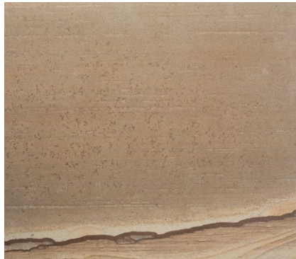
Antique Brush Finish